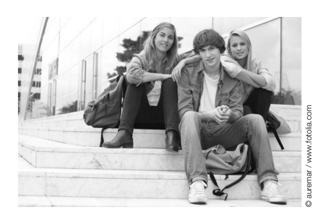
Aspects of teen life

After the second listening, you will have 45 seconds to check your answers.