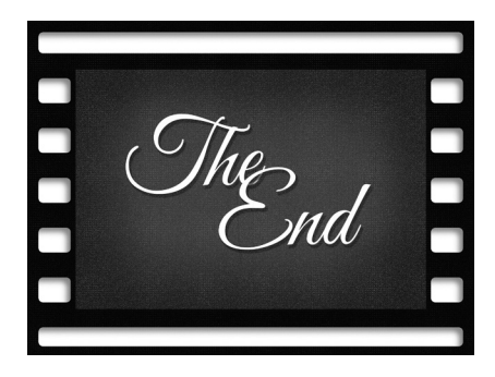
Out of sync

Read the text about the history of changing the soundtracks of films into another language. Answer the questions (1-7) using a maximum of 4 words. Write your answers in the spaces provided on the answer sheet. The first one (0) has been done for you.